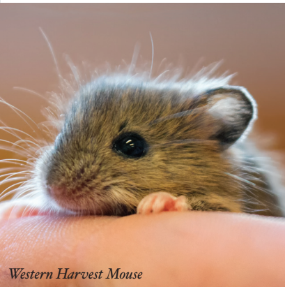
Western Harvest Mouse