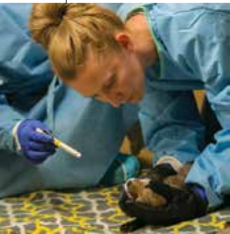
Red Fox kit

"Unless someone like you cares a whole awful lot, nothing is going to get better. It's not." —THE LORAX