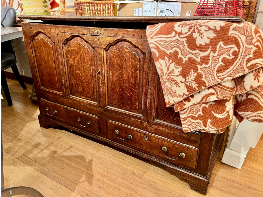
Storage Chest, $349

While you are dreaming of fresh possibilities for your home, consider consigning with Greenwood Consignment and get paid for items sold. Learn more about the consignment process here .