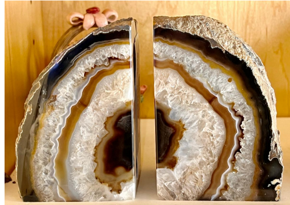
Brazilian Geode Bookends, $29