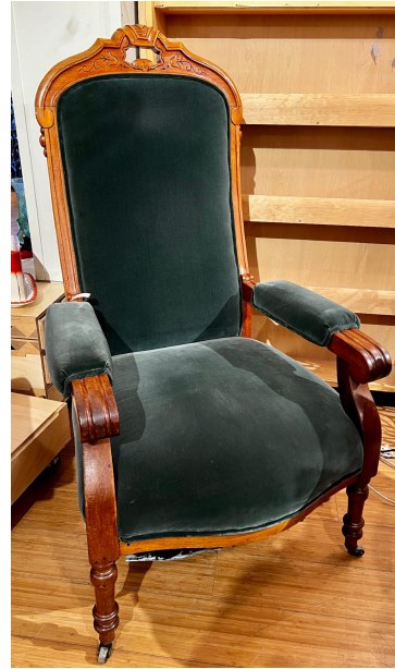
Vintage Arm Chair. $339 Item #96381