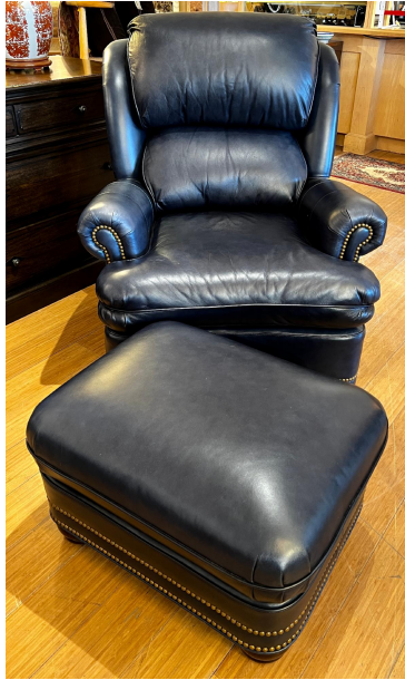
Chair & Ottoman Hancock & Moore. $1,869 Item #96537