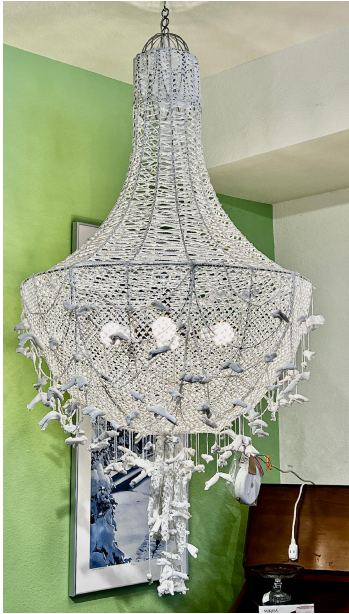
Anthropologie Chandelier. $279 Item #96718