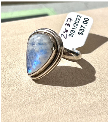
Sterling teardrop moonstone ring; $37