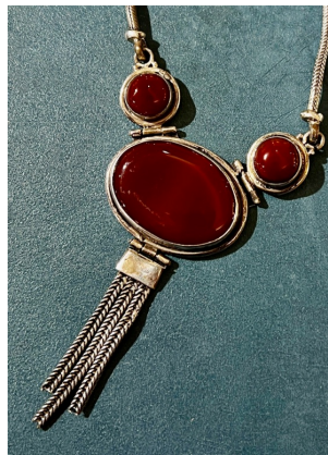
Sterling Ethnic Carnelian necklace; $48