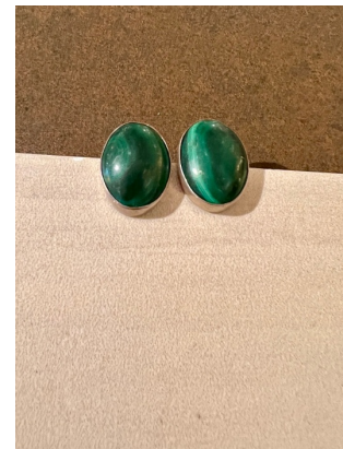
Sterling malachite oval earrings; $28

Did you see the good news? Greenwood Thrift Shop & Consignment Gallery has been voted ' Best Thrift Store ' by the Denver Westword . Want to see what all the fuss is about? View our online gallery of consignment items by clicking the button below!