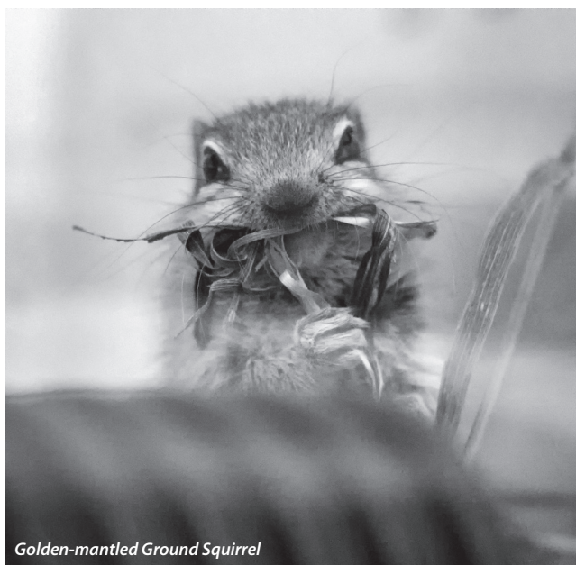
Golden-mantled Ground Squirrel

He enjoyed sweet potato, meal worms, seeds and dandelions as he grew stronger and stronger each day. Eventually, he was joined by a few other orphaned friends until they were all released together back into the wild.