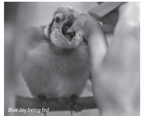
Blue Jay being fed

The many positive outcomes for the wildlife we care for inspire us to continue working so hard, along with knowing we have your continuing support. Thank you again for all that you do!