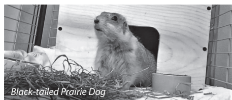
Black-tailed Prairie Dog

This Black-tailed Prairie Dog arrived at Greenwood after being poisoned. A pest control company had been brought in to remove the animals. The surrounding neighbors were enraged by this inhumane, unnecessary approach. They immediately took action to save the beloved animals by renting a shop vacuum to remove the poison from the holes. Unfortunately, some of the prairie dogs had already ingested the poison, including a female who was brought to Greenwood. She was in rough shape when she arrived. As part of her treatment, she received regular supplements of Vitamin K. Slowly but surely, she regained her health and was released.