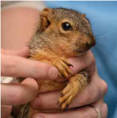
Orphaned Fox Squirrel