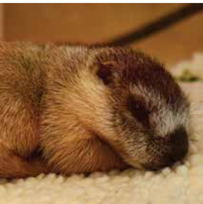
Orphaned Yellow-bellied Marmot