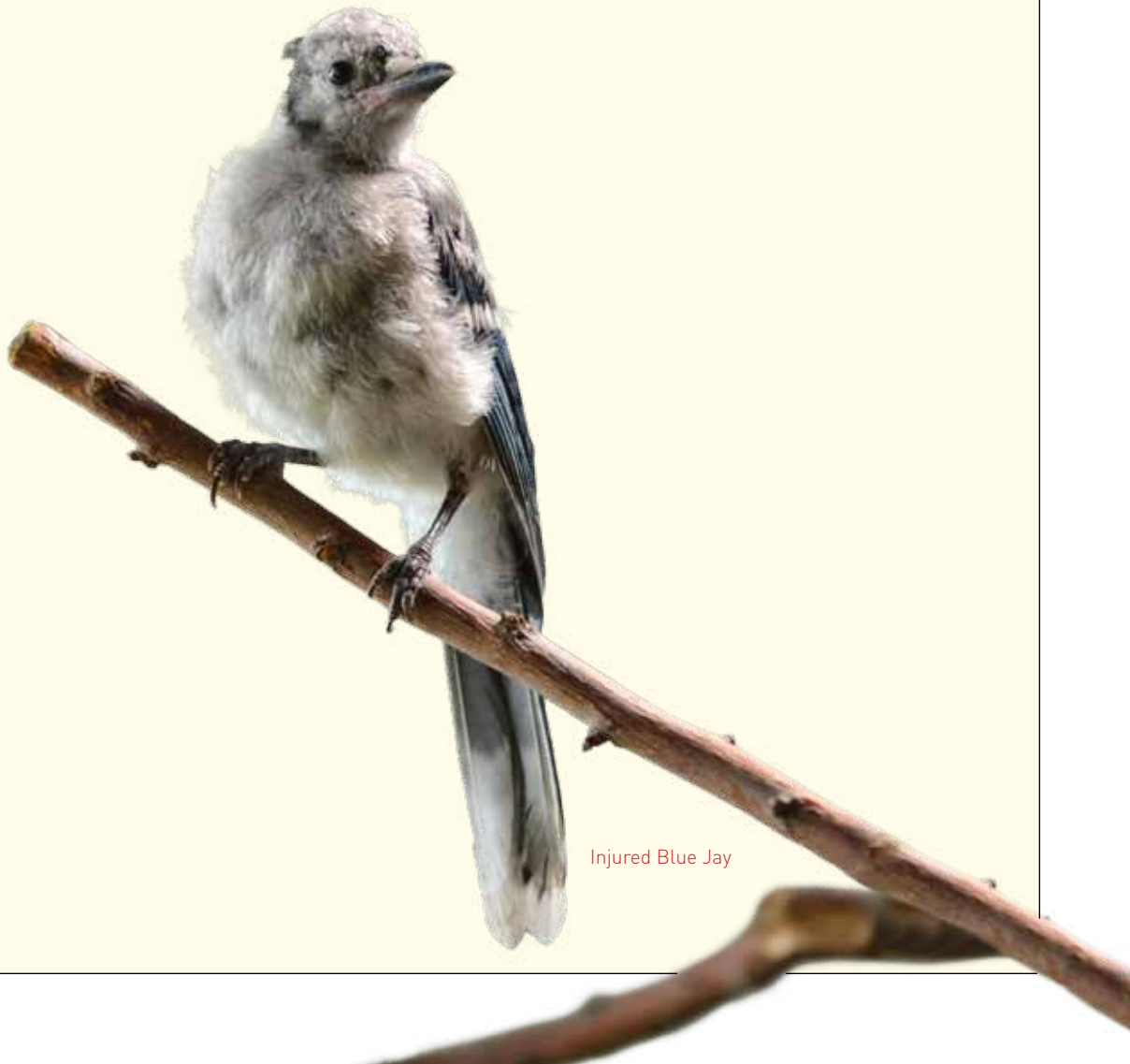
Injured Blue Jay