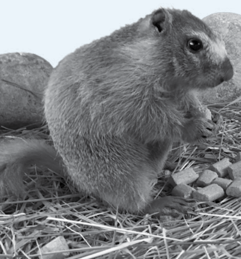
Smokey, the Yellow-bellied Marmot

Last — and definitely not least — your dedication to wildlife, as a supporter and advocate, brings our compassion cycle full circle. Because of your generosity and kindness, all of us have the opportunity to care for and bring comfort to orphaned and injured wildlife. Thank you!