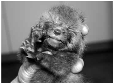
Prima, our first fox kit, upon arrival at Greenwood.

The new building has made an incredible difference for staff and volunteers but, most importantly, for the animals. We faced some very hectic and stressful times during our lengthy busy season, since our finances necessitated using more volunteers in place of seasonal staff. Yet we were able to provide high-quality care to the wildlife that depend on us, saving those who in the past would not have thrived due to the seriousness of their injuries or illnesses. Our overall success rate went from 65% in 2008 to 76% in 2009; the biggest increase was in songbirds.